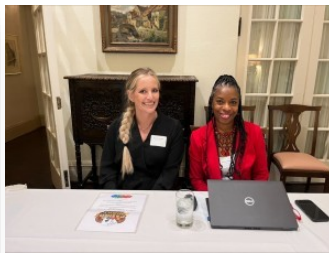
2023 Partner Event